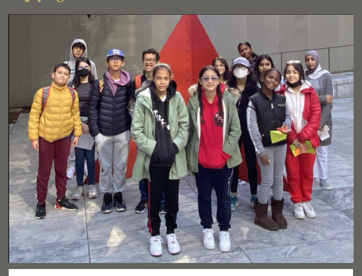
"Museum Scavenger Hunters" Explore MoMA