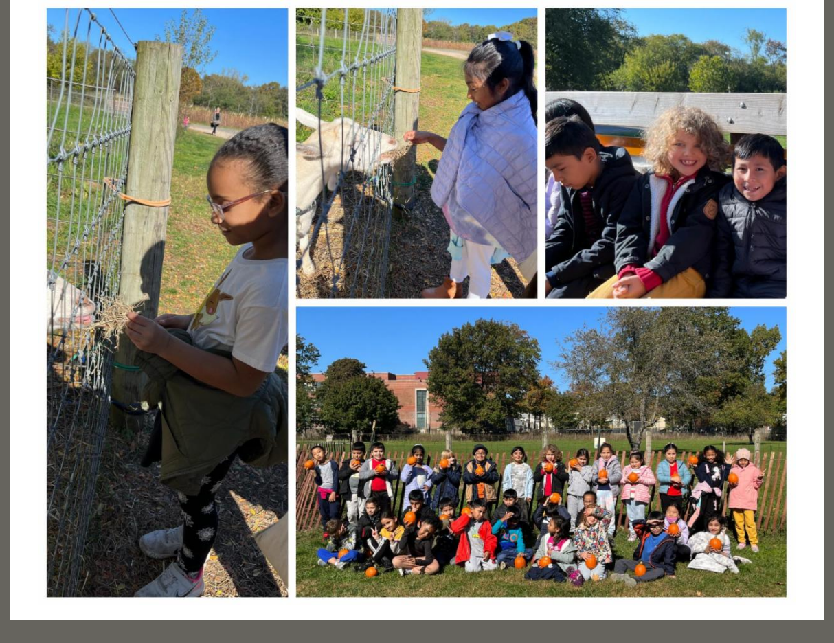
... Cluster Two Enjoying their full week of Rensizzle!