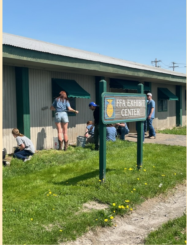
FFA students doing community service