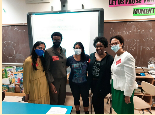
Voting Education and Voter Registration with the National Association of University Women