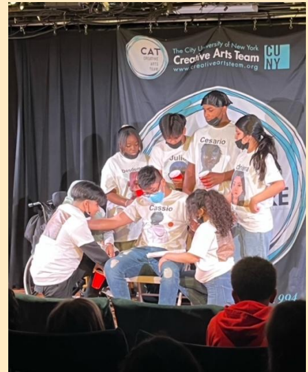
Student Shakespeare Festival at Jerry Orbach Theater